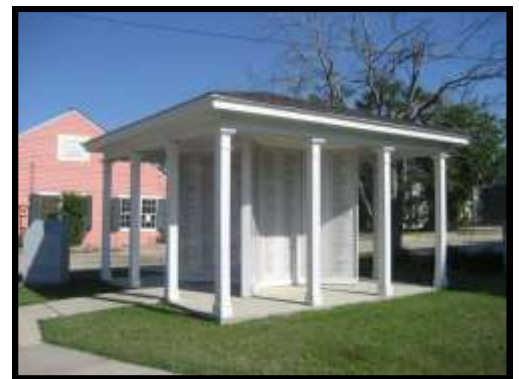
WW II MEMORIAL